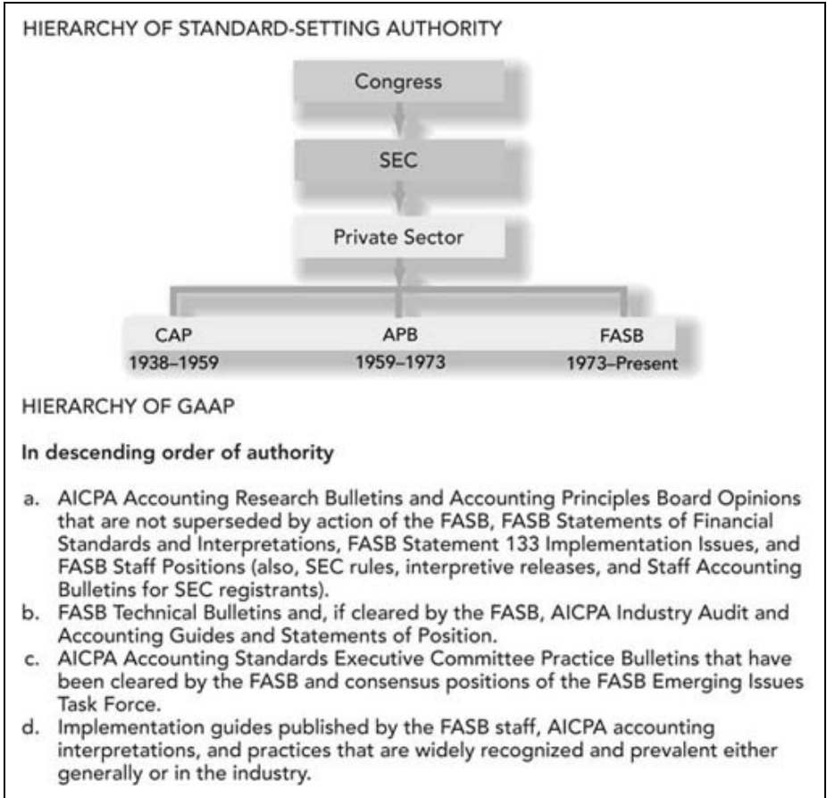
Exhibit C: Figure – Accounting Standard Setting 77

Regarding the usefulness of visuals generally, the visualizer-verbalizer learner hypothesis, long a standard of educational practice, emphasizes that some students are better at processing words and some are better at processing pictures. 78 Well-constructed visuals can drive the learning process for visual learners. In addition, a good visual can benefit learners who best